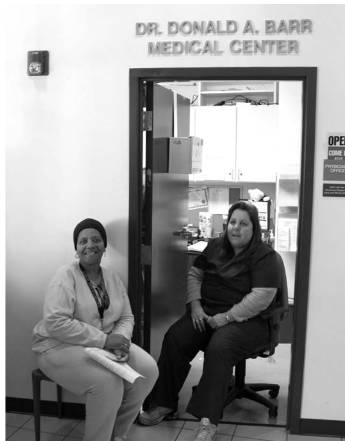
Medical care has been provided to 150 clients a month