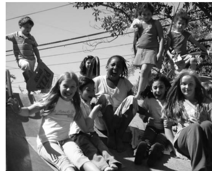
Children living at the Opportunity Center go on a Summer Adventure to Johnson Park