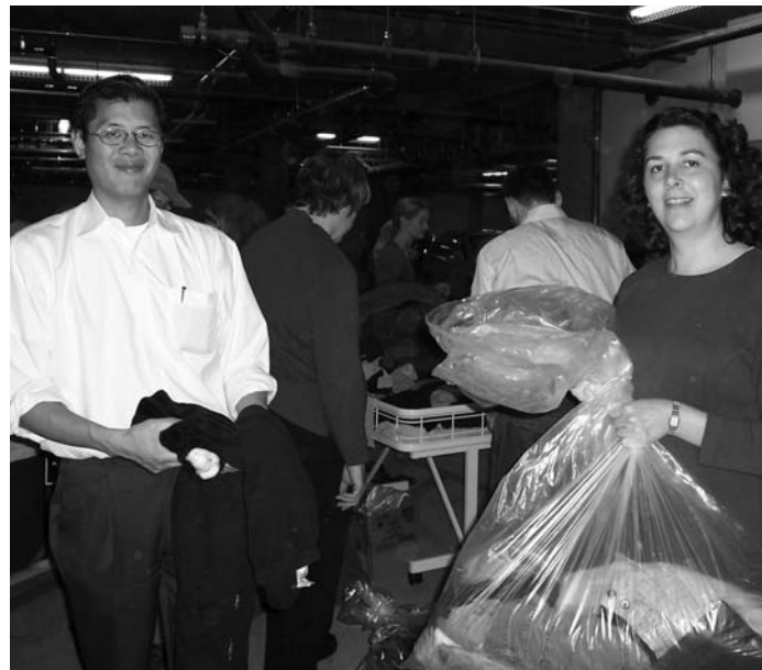
McKinsey & Company in Palo Alto assists the Clothing Closet