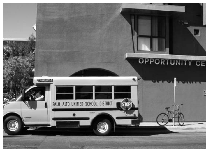
23 children enrolled in local schools