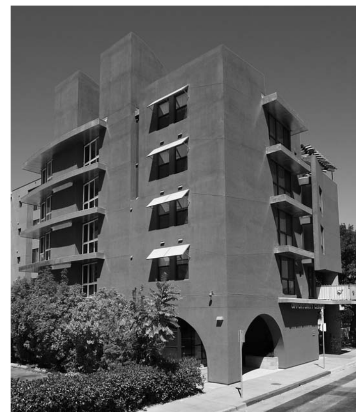
Opportunity Center of the Midpeninsula, 33 Encina Ave, Palo Alto

At the InnVision Opportunity Services Center, residents are receiving help with finding work, job training, and accessing funding benefits and medical insurance. Onsite money management services and drop in day