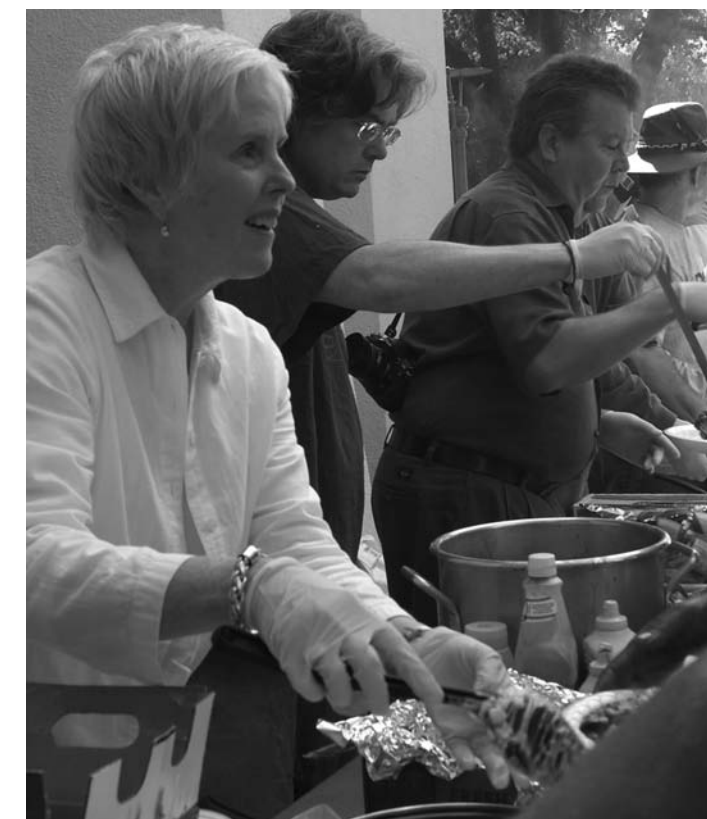
All Saints Episcopal Church prepared a BBQ for the service center