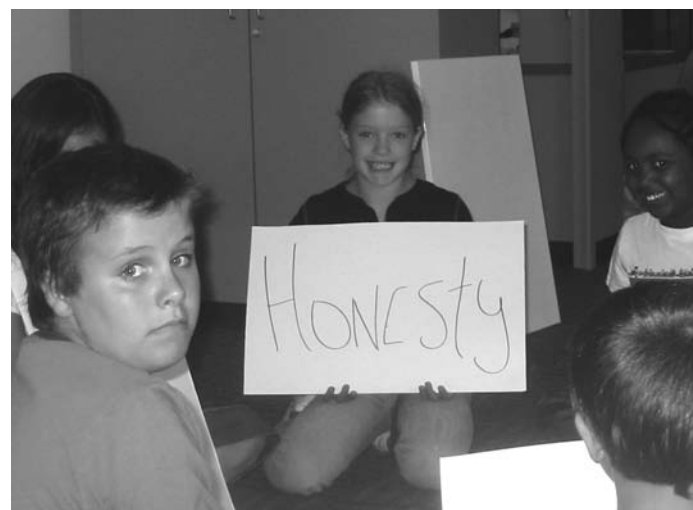
Values are discussed as part of the after-school program